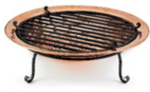
771 Fire Pit (Page 3)