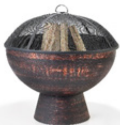
FB-2 FireBowl™ (Page 4)