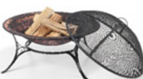
FP-2 Fire Pit (Page 5)